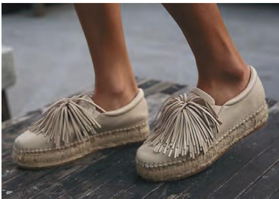
j/slides SHOP, 2nd floor, #706